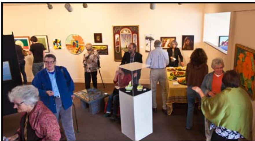
Arts Alive! at 603 F St.

Each artist received a $250 honorarium during the Set, 6 meeting of the Eureka City Council. The honoraria were made possible through generous donations made by Eureka Natural Foods and Coast Central Credit Union.