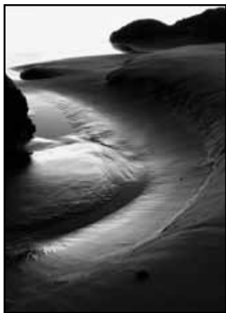
"Little River"

He encouraged us to be willing to do things differently, taking a creative leap whenever possible. I was inspired and excited by his comments. I thought we were very lucky to have him as our judge.